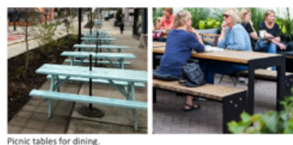
Picnic tables for dining.