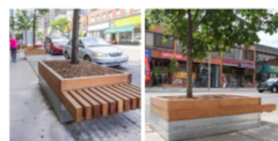
Raised planter with integrated seating.