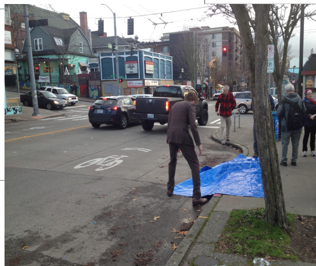
Reviewing Portland Loo footprint in location