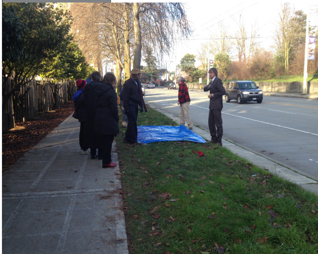
In the planting strip on the west side of 15th Ave