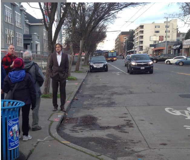
Potential curb bulb and drainage structure relocation needed