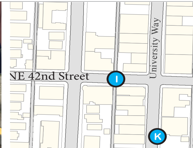
Location of potential restroom at Site I