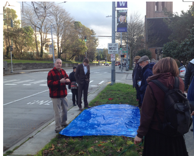
Looking south down 15th Ave and NE 43rd St intersection