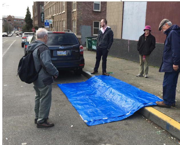
Alleyway to the west of potential location