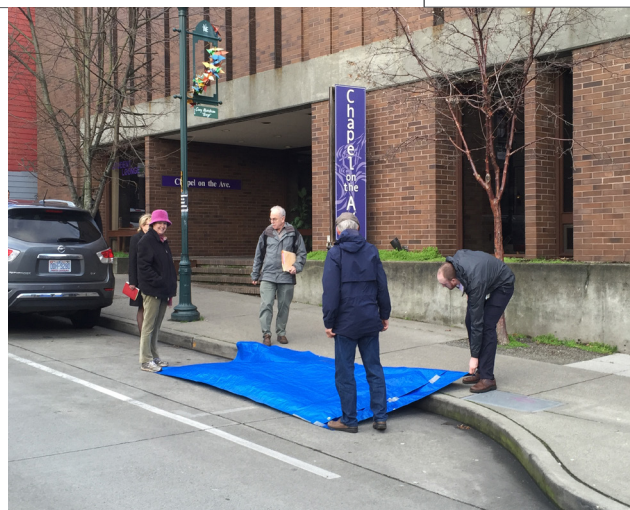
Looking north east along University Way