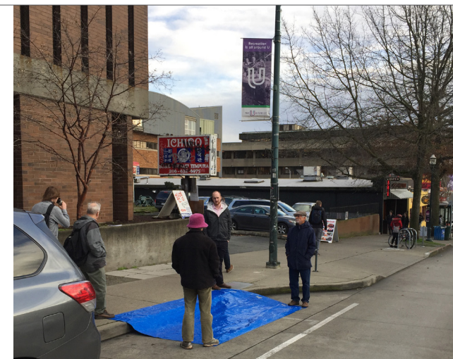
Looking south east along University Way