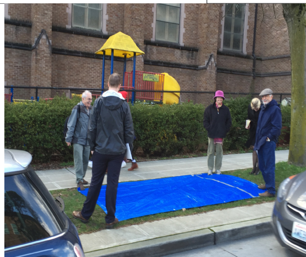
Potential Loo location in planting strip