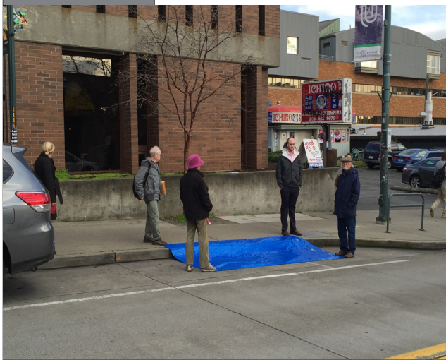
Curb bulb will need to be added in parking space