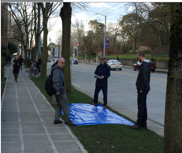
Surveying potential restroom locations at University Temple