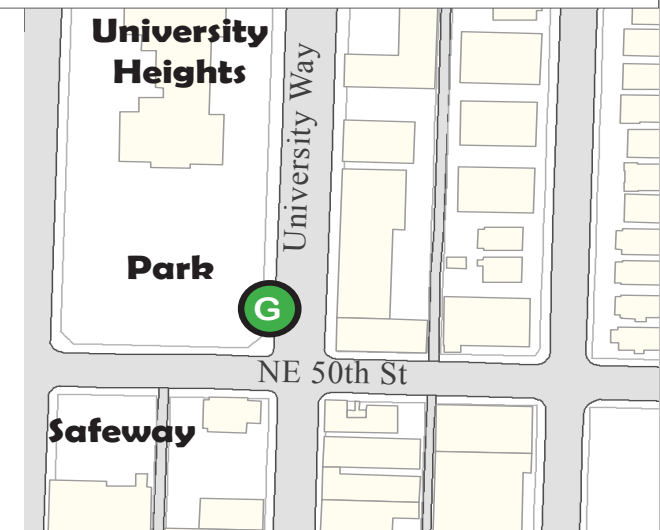
Potential loo location at Site G