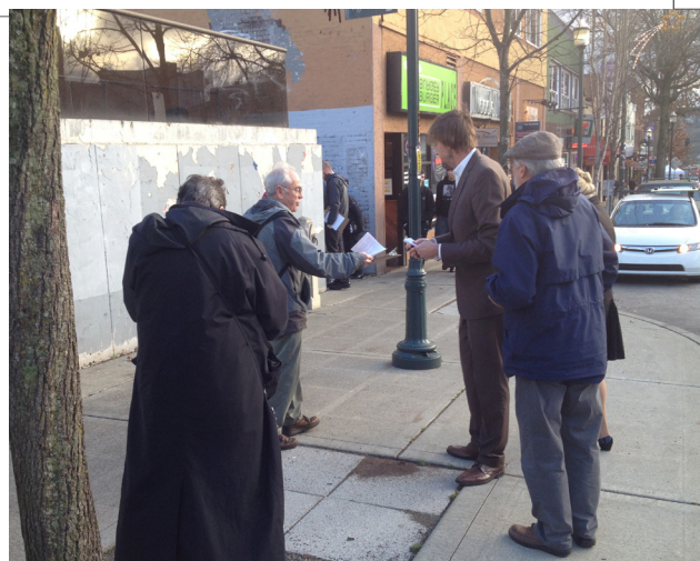
Potential Loo location located in curb bulb