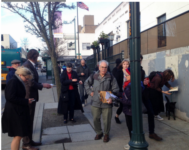
Reviewing potential location in relation to street trees and utilities