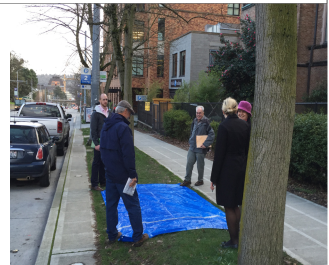
Looking south down 15th Ave