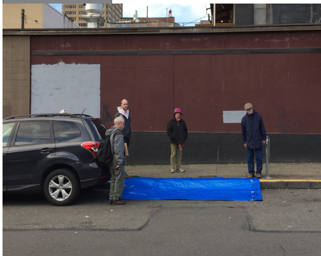
Potential restroom location on NE 42nd St adjacent to blank wall